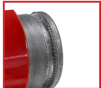
#2199-VDEX Snorkel Damaged