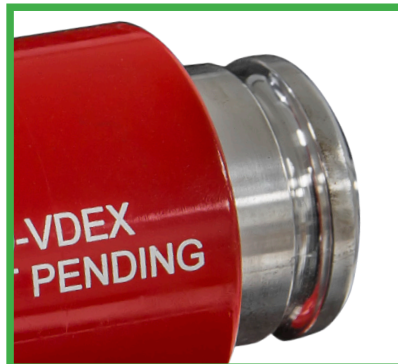
#2199-VDEX Snorkel Intact & Operational